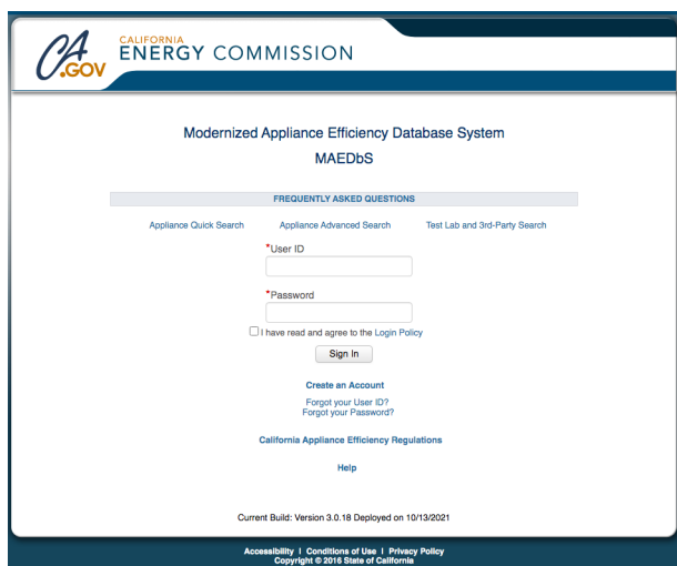
Figure 1. MAEDbS Login Page